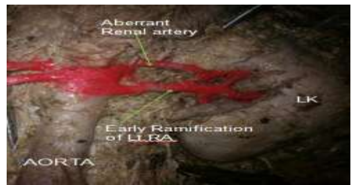
Fig 4: Showing Early Ramification of the Renal Artery