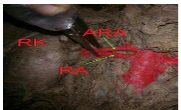
Fig 2: Showing the Accessory Renal Arteries Entering to the Hilum of the Kidney.RK-Right Kidney, RA – Renal Artery, ARA – Accessory Renal Artery