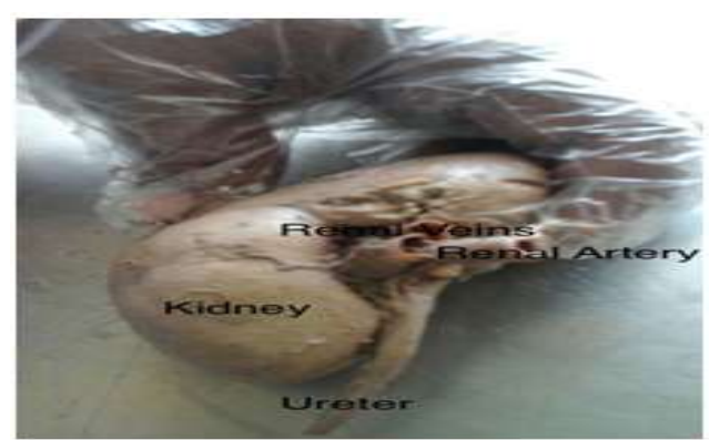
Fig 1: Showing Normal Pattern Single Renal Artery Passing Through Hilum.